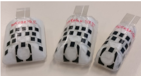
Figure 1: Pressure sensors for robotic grippers (F&P Robotic case).

Robots have been working in the industrial production for decades, however they have been doing this in an isolated environment i.e., with no humans around. In recent years, the field of collaborative robotics has gained a lot of attention and robots started working alongside their human co-workers. This change demands the robots to be aware of their surroundings in a much more comprehensive way. The Swiss SME F&P Robotics AG has been aware of this challenge in their customers' industry and is producing service robots and technology assisting, helping and facilitating activities from people's daily lives. Through the integration of flexible pressure sensors into the robotic fingers, F&P Robotics AG strives to improve its products further.